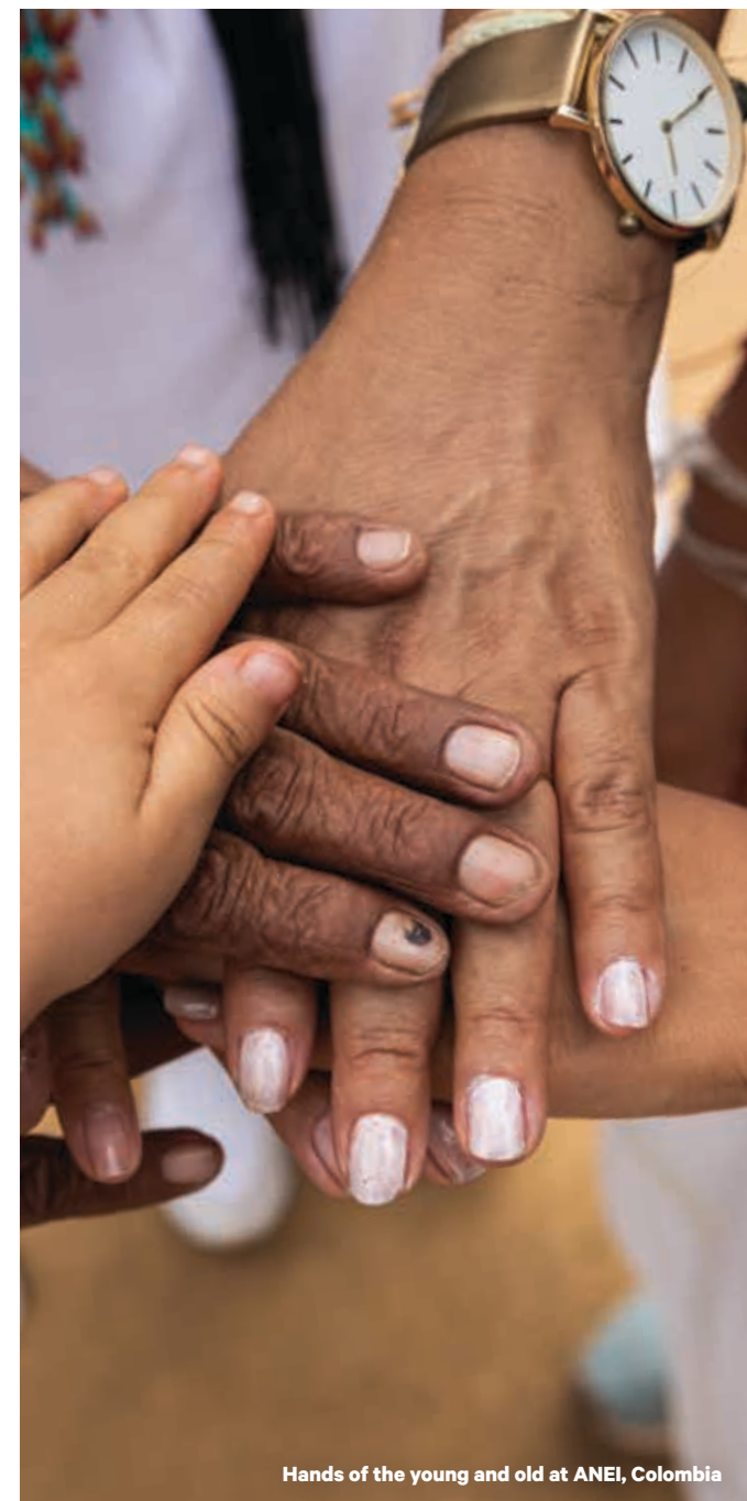
Hands of the young and old at ANEI, Colombia

Each part of the whānau needs to trust itself and hold its own power. Yet to work together as a movement we need to delegate power to other parts of the whānau so that those people can get on with the work they need to do. This requires trust. When we place our trust in other people to carry out their role effectively, we empower them to succeed. The integrity of our circular connected structure lies in the trust we place in those on each side of us.