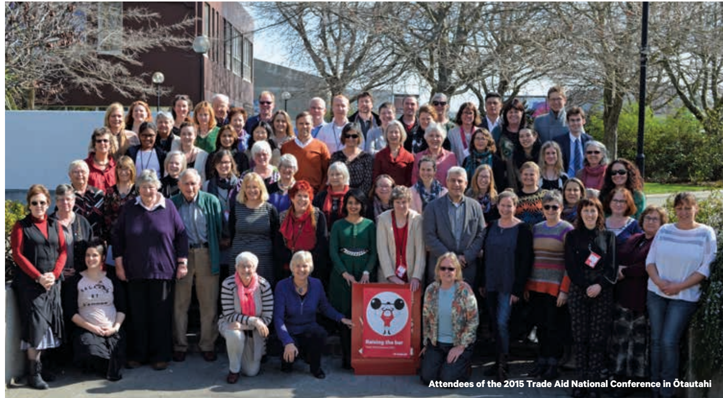
Attendees of the 2015 Trade Aid National Conference in Ōtautahi

The New Zealand Trade Aid Movement has a hybrid culture that combines development, education and commercial activities. We believe that the principles of fair trade and commerce play an important role in making positive change in the world. At the same time we believe in the power of volunteering and community service. To make this culture work we have developed a hybrid structure that includes both charitable and commercial entities.