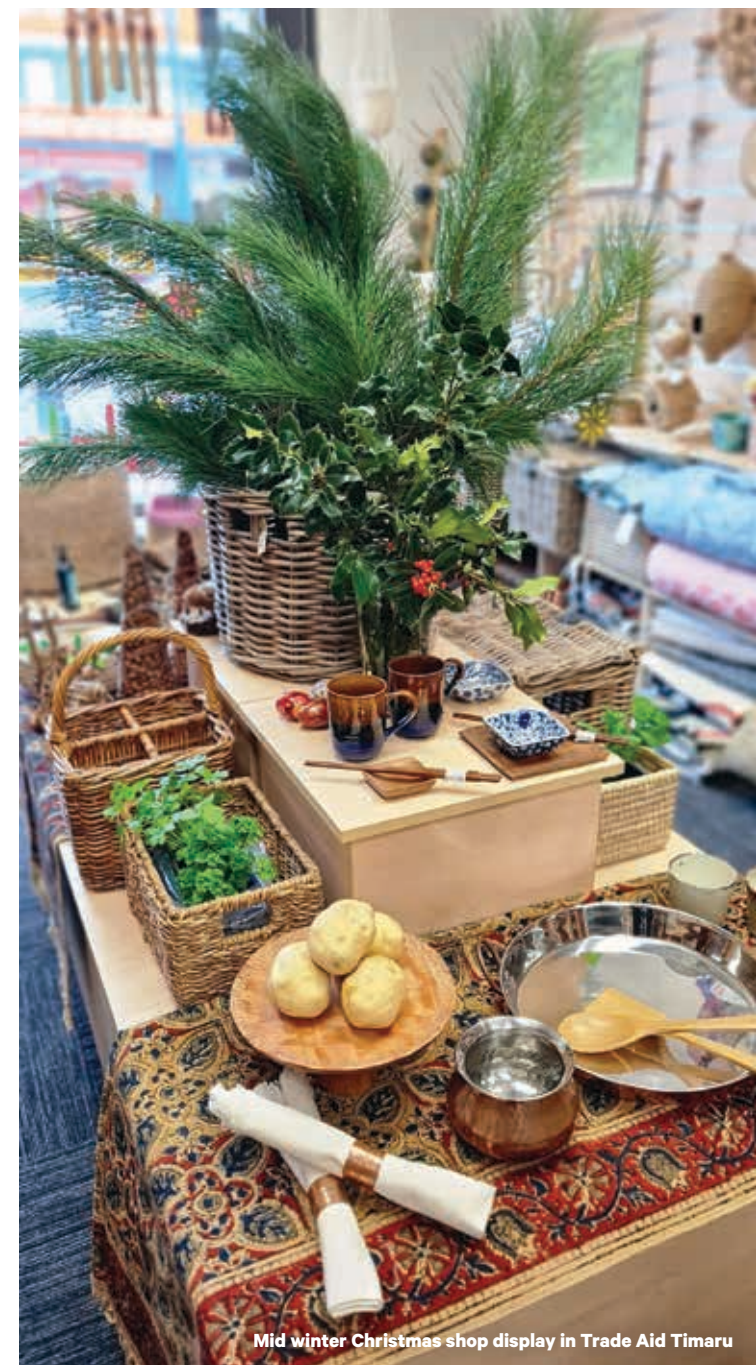
Mid winter Christmas shop display in Trade Aid Timaru