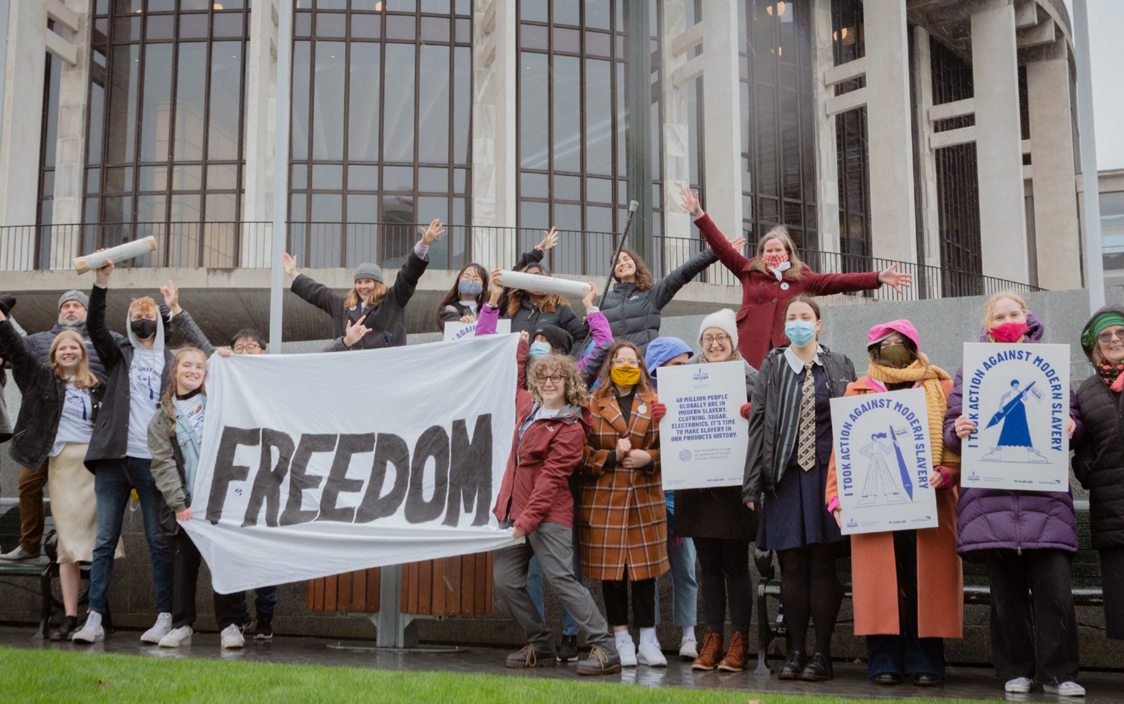
Supporters of the Sign for Freedom campaign at the Petition handover in Parliament Grounds on June 29, 2021. The campaign was run by Trade Aid and World Vision and urged the government for Modern Slavery Legislation. For more info visit www.signforfreedom.nz