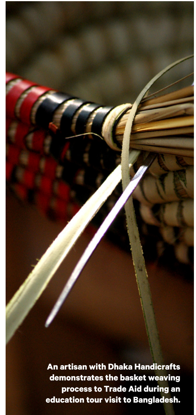
An artisan with Dhaka Handicrafts demonstrates the basket weaving process to Trade Aid during an education tour visit to Bangladesh.

You can find copies of the policies on the Trust Resources Webpage.